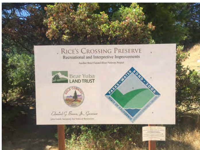
Picture of the sign put up by BYLT at Rice's Crossing. GCTC made a contribution towards developing equestrian friendly trails and trail head parking.