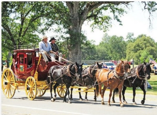
Penn Valley Rodeo Parade!

Minutes of the GCTC Board Meetings and the current 2020 GCTC Events Calendar can be accessed on the GCTC Website www.GoldCountryTrailsCouncil.org